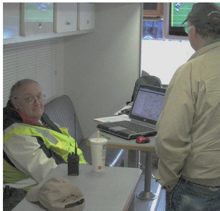
K4XRM & K14MXP active in the Durham County Sheriff's Van