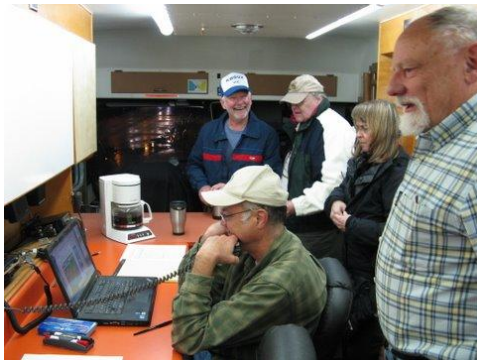
Before dawn in the MCU: KK4PH operating with K0OUX, K4XRM, N8MOF & W4BOH looking on

A Very BIG Thank you to ALL who participated in last month's Habitat for Humanity Halloween Hoot Bike Event . What a way to start the day with cold and windy rain as a few brave souls who wanted to ride their bicycles came out for a great cause. We were ready and if I didn't get to see all of you personally, I want to express my Thanks for a job well done. Everything worked fairly well on our end with some unexpected last minute changes but you remain flexible and go with your best.